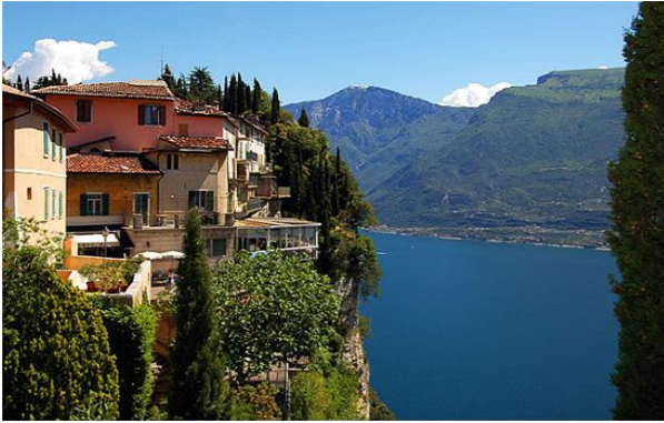
Figure 7: Tremosine, an entrepôt on the way to heaven.

Arco is the capital of mountaineering, and mountaineers, as is commonly known, are poor folk and cheapskates. This is why here in Arco the mountaineering equipment is very cheap. Alpinists, the aristocrats of mountain tourism, do not turn their noses from stocking up exactly here. The road from Arco and Riva Del Garda along the steep western shore of the lake starts with tunnels which turn into galleries unfolding the view on the lake. If one doesn't head to Salo, the final stronghold of the Mussolini's government, but instead turns right shortly into the sheer cliff, the road will move stiff upwards like a cork-screw, giving, however, a feel of a climbdown to hell. Rocks, waterfalls, waterdrops, thickets, steep slopes and suddenly, as if nothing had happened, a cute and homely small town of Tremosine. A couple of restaurants emplaced beyond the cliff, hanging in the air, from where one can enjoy an exciting view of Lake Garda. A sip of refreshing prosecco and one is ready to fly and dissolve, to melt and turn into an invisible atom or a drop in Lake Garda's waters (Figure 7).