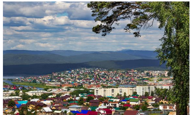
Figure 15: A toylike Miass.

At the beginning of the 18th century, an entrepreneur and industrialist Akinfiy Demidov founded more than 20 cities on the Ural. A convoy of vessels was travelling upstream the Ural rivers where one could find infinite supplies of forest and water stretching beyond the horizon that were needed for metal manufacturing. At the places where Akinfiy saw exceptionally beautiful sceneries he ordered to go on shore, and if ore finders found copper or iron ore there, a mine and a town were built. Tagil, Kyshtym, Miass, Zlatoust, Chelyaba, Kasli and it was not ore, forest (required to produce wood charcoal) or water, but beauty that served as the main input to foundation of the Ural cities (Figure 15).