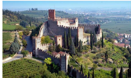
Figure 5: Soave, a place where they produce most exquisite wines that complement the town and surrounding vineyards.