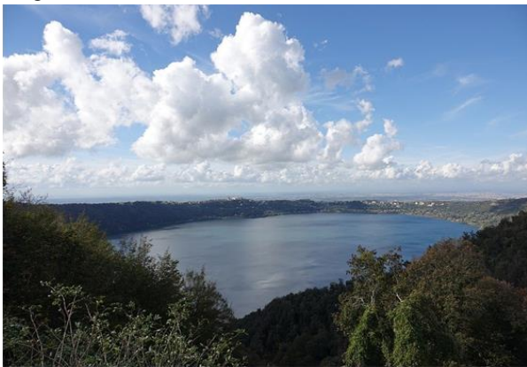
Figure 8: Albano, at the foreground: the summer residence of the Pope, at present the agricultural enterprise of the Vatican.

In the mountains, to the south of Rome, there is a volcanic massif with three crater funnels. Two of them are filled with water which creates a small lake Nemi and a bigger lake Albano (the White lake) (Figure 8).