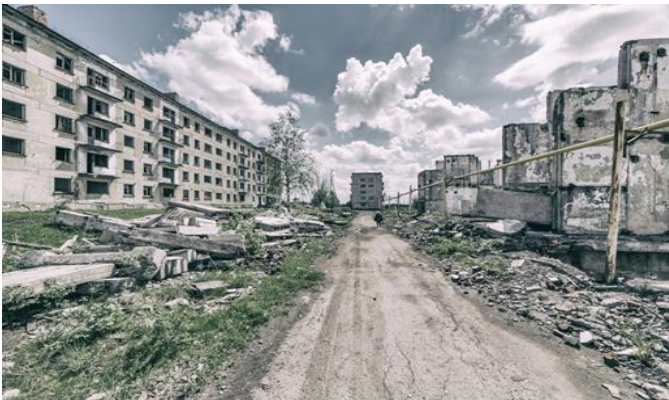
Figure 2: There are dozens of cities like this. And they keep on building them.

Braudel wrote: “The Medieval cities revived the freedom that the mankind had almost lost” [13-16].