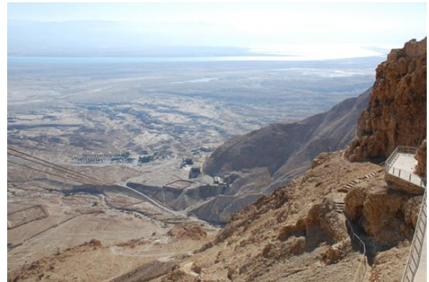
Figure 3: The view from the Masada fortress.

From the top of the Masada fortress, at the shore of the Dead Sea in Israel, one can clearly see (in the low left corner) a camp of the Roman legion (Figure 3):