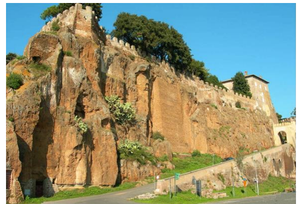
Figure 10: Ceri – a town on a rock, a temple, 80 residents and a restaurant for 300 persons. One can never pry oneself away from the amazing view unfolding from here or find words to describe it.

The beauty is often very localized. On the south edge of Monterey Bay there formed a cluster of towns and cities that are mostly of minuscule and delicate nature and do not strive to expand, develop and grow in population. Monterey (32 000 people),