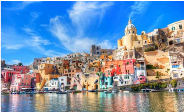
Figure 13: Naples, a marvellous human ant-hill that plays football on every patch and sings “O, solo mio”.