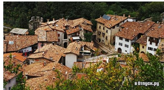
Figure 6: Arco, a small overland Venice, a snail town coiled inwards, where on the outside in the lowland there are open roadways while on the highland there are hidden lanes with life sheltered from outsiders and totally open to neighbors. Yards, benches, nooks and blind alleys.