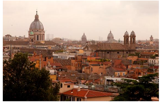
Figure 14: Warm colours of Rome.

At the beginning of the 18th century, an entrepreneur and industrialist Akinfiy Demidov founded more than 20 cities on the Ural. A convoy of vessels was travelling upstream the Ural rivers where one could find infinite supplies of forest and water stretching beyond the horizon that were needed for metal manufacturing. At the places where Akinfiy saw exceptionally beautiful sceneries he ordered to go on shore, and if ore finders found copper or iron ore there, a mine and a town were built. Tagil, Kyshtym, Miass, Zlatoust, Chelyaba, Kasli and it was not ore, forest (required to produce wood charcoal) or water, but beauty that served as the main input to foundation of the Ural cities (Figure 15).