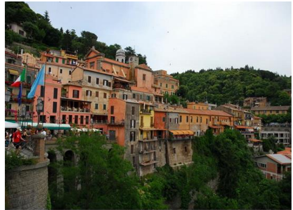
Figure 9: Bright colours is another attraction of the small town over lake Nemi.

Inspired by such picturesque landscape the townpeople do everything to make their place even more beautiful. The place is so beautiful but so tiny – it will never grow into a big city. Paul Vidal de la Blanche (Blanche, 1903, 2000, 2021) insists on orography and hydrography as the main factors inciting the charm of French cities, towns, settlements and sceneries, and he is definitely right.