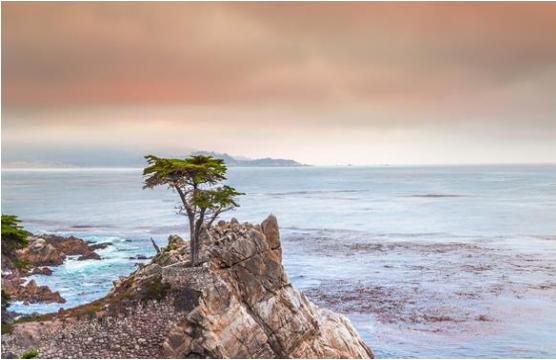
Figure 11: Pebble Beach, “A Lone Cypress”. Point Lobos at the horizon described by Stevenson as the Treasure Island.

Pacific Grove (15 000 people), Pebble Beach (less than 3000 people), Carmel-by-the-Ocean (15 000 people) (Figure 11). Only very few cities manage to grow large without destroying their beauty and even enriching it. Venice, Genoa, Verona, Florence, Rome Barcelona, Cordoba, Sevilla Paris, Lyon, Marseilles, San Francisco, Boston. Rio de Janeiro – it is the beauty of these and very few other large cities that attracts people above all things (Figure 12-14).