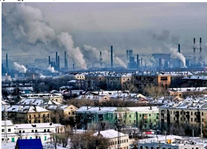
Figure 1: “Sleeper” workshop at the Magnitogorsk iron and steel works.

I was very lucky. My teachers of urban geography either at university or at work, or at the conferences and other public events, in passing, were including geographers, architects, economists, and historians. For a long time they have been trying to convince me that almost all cities originated as transport and industry hubs while only very few of them developed in exotic ways: as resorts, fortresses, agro-industrial and trading centers, places of worship and religious sites (the functional-genetic typology of cities).