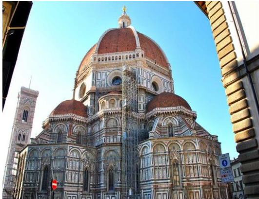
Figure 12: I have never seen anything this breathtakingly beautiful in my life. The Cattedrale di Santa Maria del Fiore – the most unexpected miracle in the world.