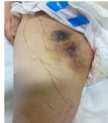
Figure 2: Orthopedic and Vascular consultation has shown no indication for surgical treatment.

The popliteal, tibial and tibial arteries show a progressive decrease in filamentous caliber; Great maintenance of the foot vessels. On 17 April 2021, computed tomography and inferior angiography showed an increase in hematoma volume and hyperdense areas in the context of hematopoiesis but without significant spillage of contrast medium at different stages of acquisition (Figure 2).