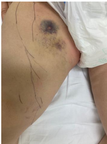
Figure 1: Prophylaxis with enoxaparin has been suspended.

The patient had a history of drug-compatible arterial hypertension, obesity (BMI 36), paroxysmal atrial fibrillation, obstructive sleep apnea, hypercholesterolemia and multifactorial anemia. Response to treatment was refractory. On April 15, 2021, our patient had a hematoma in the groin area of the right leg in the absence of other symptoms. Hemoglobin in reduction. Prophylaxis with Enoxaparin was suspended (Figure 1).