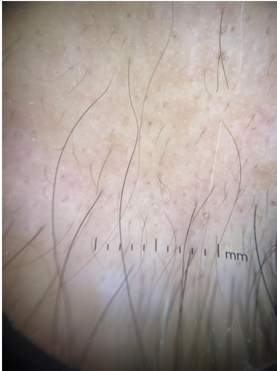
Figure 2: Dermoscopic image showing fluffy hair, coiled hair, leukotrich hair, white spots and pigmented areas without structures.