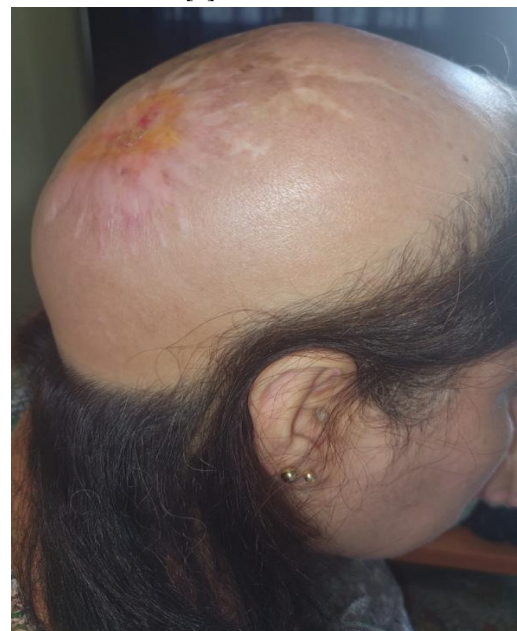
Figure 1: Clinical picture of scarring alopecia of the vertex centered by an atrophic scar.

Hair loss, temporary or permanent, is one of the most stressful side effects for patients undergoing oncologic treatment. The true prevalence of permanent alopecia by radiation may be underestimated as many patients do not complain and accept it as the price of the treatment [3].