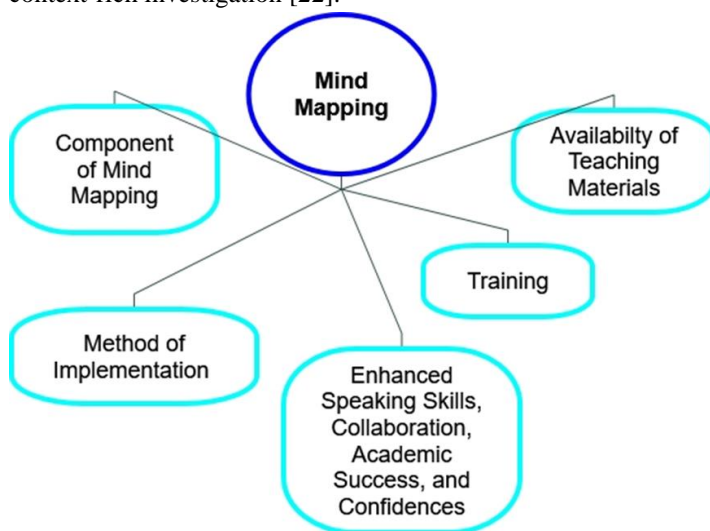
Figure 2: Shows the Emerging Theme from the Research Findings.

To achieve the study objectives, the researcher used a qualitative approach to comprehensively analyse how mapping strategies impact students' speaking skills, as perceived by English language teachers in Palestine. The main objective is to attain a thorough comprehension of mind mapping in English speaking skills lessons. As [21] suggest, qualitative methods such as interviews and open-ended surveys facilitate the collection and analysis of in-depth data, thereby enabling a profound exploration of the impact of mapping strategies on students' speaking skills. The selected participant for this study is an English class teacher, chosen to represent the perspective of educators. This ensures a focused and context-rich investigation [22].